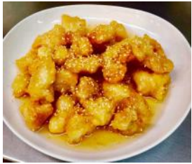
33. Sesame Chicken

31. Sweet and Sour Chicken / Pork with Pineapple 菠蘿咕嚕豬肉/雞肉 19.95 Chicken or Pork with pineapple in our scratch made sweet and sour sauce. We use 100% real pineapple juice with no artificial colour or flavour