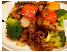
39. Stir Fried Spicy Black Bean Chicken

38. Chicken or Beef with Tomato 番茄炒牛/雞肉 22.95 Your choice of Chicken or Beef stir fried with tomato, and vegetable slices