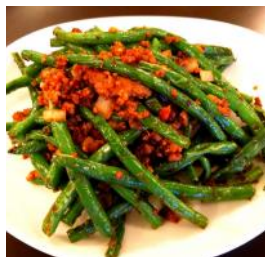
48. Spicy Green Beans

雀巢炒時蔬 19.95 Stir fried Mushrooms, broccoli, baby corn, and red peppers in a nest of crispy noodles Chicken or Beef 22.95 BBQ Pork 22.95 Tofu 22.95 Prawns 24.95 House 24.95