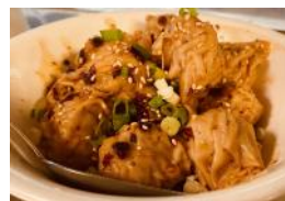
4. Wontons in Szechuan Chili oil

紅油抄手 (6) 13.95 (12) 17.95 Handmade wontons in a spice infused chili oil.