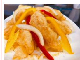
19. GF Salt & Pepper Squid

豉汁炒蝦 24.95 Broccoli, red & green pepper, onion & baby corn