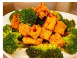
51. Spicy Tofu with Broccoli

麻婆素豆腐 🍴 🌿 🌶️ 19.95 Tofu stewed in our house made spicy sauce Minced Pork 22.95