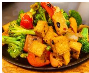
23. Black Bean Sizzling Platter with Tofu