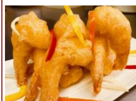
20. GF Salt & Pepper Jumbo Prawns

乾煸四季豆蝦 24.95 Green beans fried until just wrinkled and fried with onions, garlic, and house spices