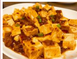
50. Mapo Tofu With Minced Pork

咖哩炒雜菜 🍴 🌿 🌶️ 16.95 Stir fried with Seasonal Veggies, baby corn, onions in our mild coconut curry sauce Chicken or Beef 19.95 BBQ Pork 19.95 Tofu 19.95 Prawns 24.95 House 24.95