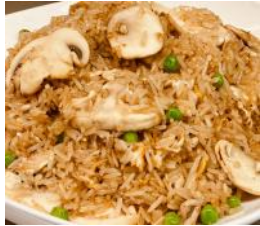
66. Mushroom fried rice