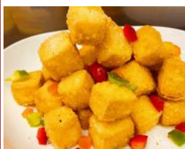
54. Salt & Pepper Tofu

姜汁豆腐 🍴 🌿 🌶️ 19.95 Crisp Tofu, stir fried with spicy ginger sauce