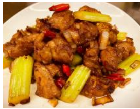
40. Wok Fried ChongQing Spicy Chicken

40. Wok Fried ChongQing Spicy Chicken 重慶辣子鸡 22.95 Spicy Chicken strips stir fried with celery and red peppers