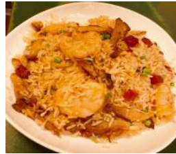
69.. House Fried Rice