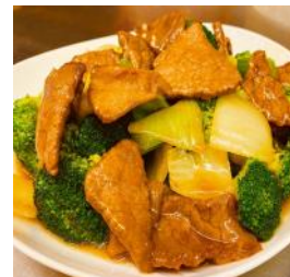
37. Beef Broccoli

44. Salt and Pepper Spareribs 椒盐排骨 22.95 Pork Ribs flavored with salt and pepper