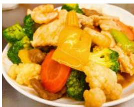
46. Chop Suey House

蜜汁排骨 🍴 21.95 Sweet and Sour or Szechuan Ginger 甜酸 // 姜汁排骨 🍴 🌶️ 21.95 An extra special pleaser for summer. Pork Ribs flavored with delicious honey and golden garlic. Try it with our House made sauce