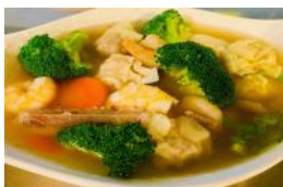
1. Wor Wonton Soup