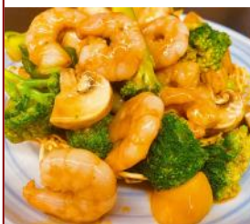
15. Noodle Nest with Prawns