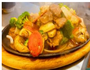
22. Black Pepper Sizzling Platter with Beef