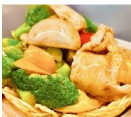
47. Noodle Nest with Chicken

蠔油炒雜菜 16.95 Seasonal Veggies, baby corn, and onions stir fried in garlic and house sauce Chicken or Beef 19.95 BBQ Pork 19.95 Tofu 19.95 Prawns 22.95 House 22.95