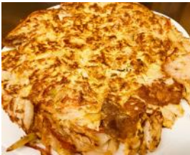
43. House Egg Foo Young

43. House Egg Foo Young 美宮芙蓉蛋 22.95 Chinese egg omelette filled with Chicken, Beef, Prawns and vegetable slices.