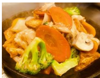
28. House Special Braised Tofu