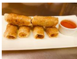
8. Mekong Baby Vietnamese Style

蒜香豆腐 17.95 Crisp Tofu stir fried with garlic