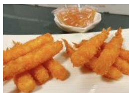
5..Deep Fried Prawns