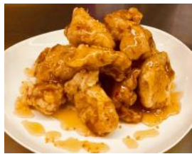
45. Honey Garlic Spareribs