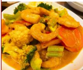
49. Coconut Curry with Prawns

乾煸四季豆 🍴 🌿 🌶️ 19.95 Green beans fried until just wrinkled and fried with onions, garlic, and house spices Chicken 21.95 Beef 21.95 Pork 21.95 Tofu 21.95 Prawns 24.95 House 24.95