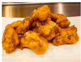
6. GF Dry Garlic Ribs

素春卷 12.95 6 rolls Served with plum sauce Add more (each) +2.50