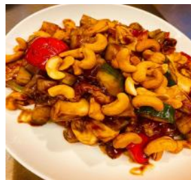
36. Cashew Chicken

37 Chicken or Beef and Broccoli 西蘭花雞肉或牛肉 19.95 Your choice of Chicken or Beef stir fried with broccoli, onion, and celery