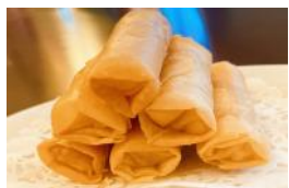
7. Veg. Baby Spring Rolls

美宮迷你春卷 15.95 6 baby Vietnamese style spring rolls with Mekong sauce Add more (each) +3.00