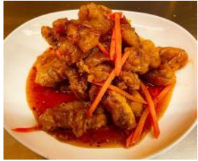
32. Szechuan Ginger Beef

30. Sweet and Sour Chicken / Pork 咕嚕豬肉/雞肉 19.95 Chicken or Pork with our house made sweet and sour sauce.