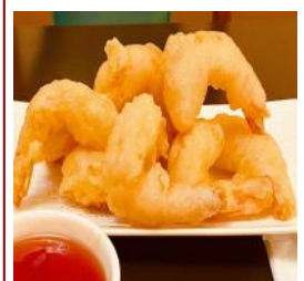
21. GF Sweet & Sour Jumbo Prawns

椒鹽大蝦 24.95 Stir fried with black peppers and onion greens